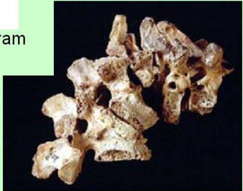
6 bones from a woman's back found at Wharram Percy.