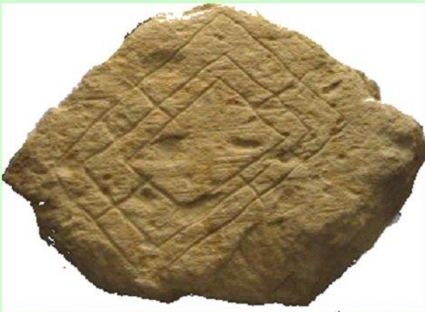
A carved stone found at Wharram Percy.